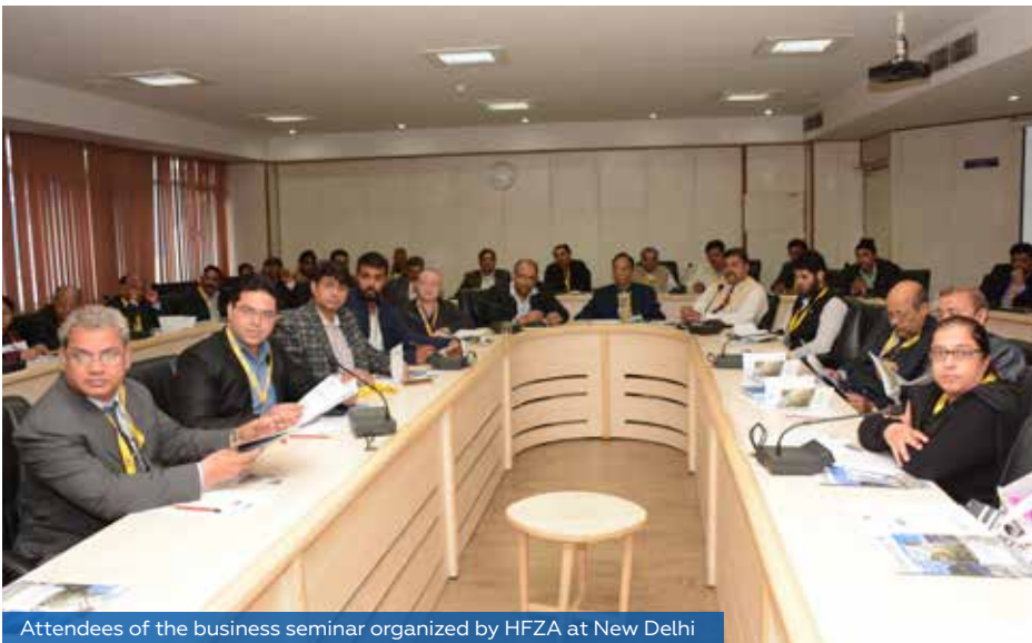
Attendees of the business seminar organized by HFZA at New Delhi

In a bid to attract potential investors from different sectors across India, Hamriyah Free Zone Authority (HFZA) organized a business seminar in New Delhi, India, on 6th February 2017, in collaboration with the PHD Chamber of Commerce & Industry, a multi-state apex organization that acts as a catalyst in the promotion of industry, trade and entrepreneurship.