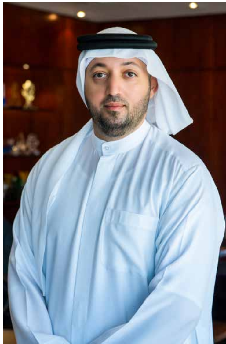
SAUD SALIM AL MAZROUEI